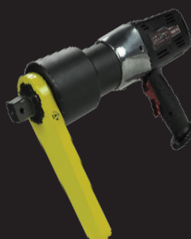
STRAIGHT REACTION ARM