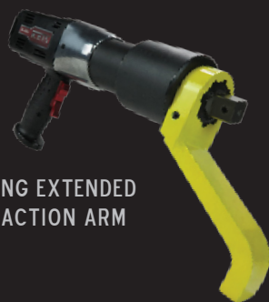
LONG EXTENDED REACTION ARM