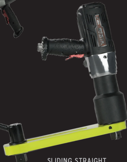
SLIDING STRAIGHT REACTION ARM

Width 9" Height 12" Length 12" Weight 12 lbs / 5.4 kg