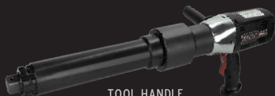
TOOL HANDLE NOSE EXTENSION

ACCURATE - A TRUE TORQUE INSTRUMENT INDUSTRIAL - BUILT FOR EXTENDED DAILY USE ACCOUNTABLE - FOR TORQUE / ANGLE / APPLICATION